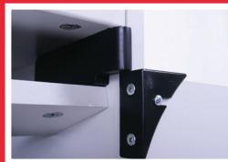
180 Degree nylon hinge for unobstructed collection