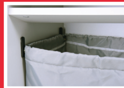
Nylon bag hooks makes bag fit tight. No paper misses the bag.